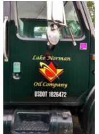
Lake Norman Oil